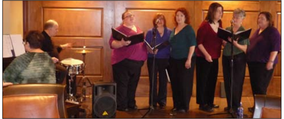
At the 2012 Wagy Awards members and friends enjoyed a wonderful Holiday meal together and festive music by the Treblemakers.