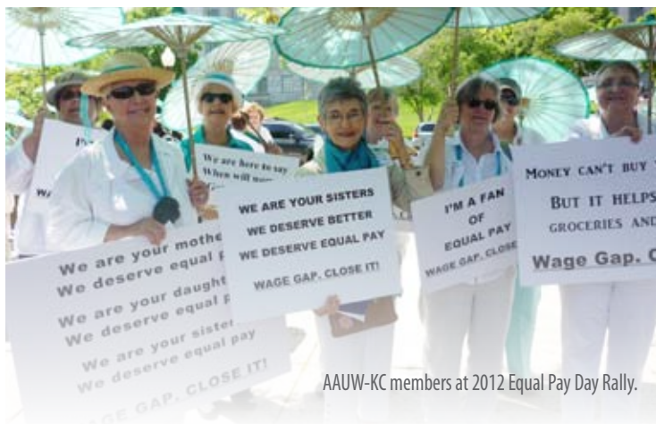
AAUW-KC members at 2012 Equal Pay Day Rally.