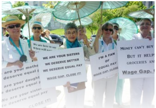
AAUW-KC members at the Equal Pay Day Rally in Jefferson City in April 2012.