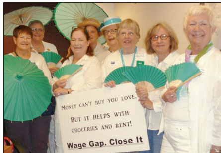
Many AAUW-KC members showed their support for Equal Pay at the 2013 annual rally in Jefferson City.