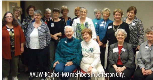
AAUW-KC and -MO members in Jefferson City.

SB 144 requires the Department of Labor and Industrial Relations to establish guidelines relating to gender pay equality. Once this bill becomes law, we women's advocates will push for an amendment stipulating penalties to be applied to employers in violation.