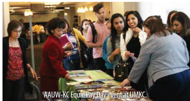
AAUW-KC Equal Pay Day event at UMKC.

Equal Pay Legislation is on the move in Missouri! What more fitting close to an exciting, productive day at the Capitol in Jefferson City, Missouri.