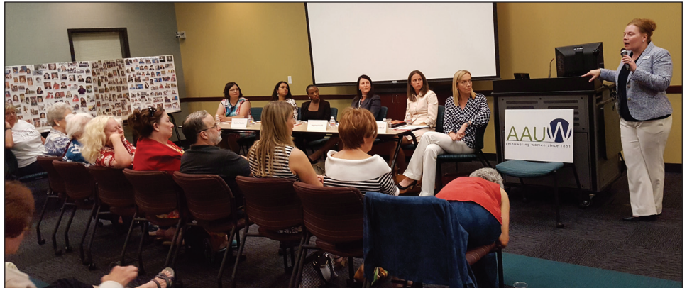
August 2016 WEW Powerful Solutions: When Women Lead event at the National Archives, Kansas City.