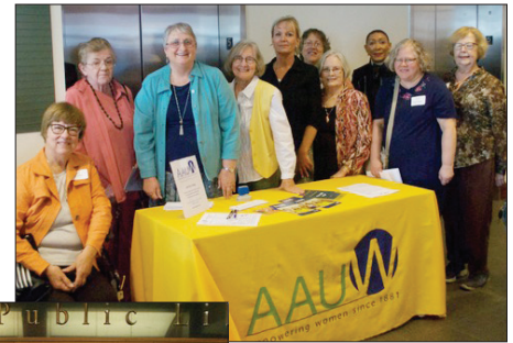
Some of the members of the 2017 Thorpe Menn Reading and Event Committees.

We are already making plans for our 40th annual event set for October 5, 2018 . If you would like to nominate an author, please visit the AAUW-KC website and go to the Thorpe Menn page under “Events” for guidelines and instructions. The deadline for nominations is May 1, 2018 .